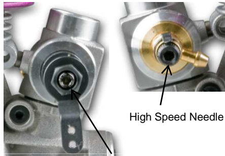
High Speed Needle